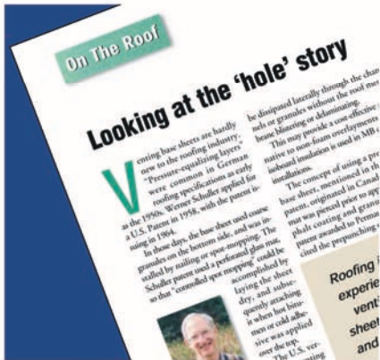
RSI (Roofing, Siding, Insulation) Magazine, October 2000

CAUTION – Do Not use with direct application of torch-applied MB roofing