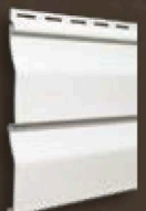
Double 4.5" Dutch Lap