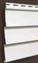
Triple 3" Traditional Lap