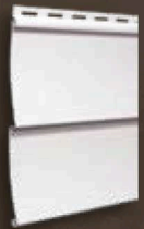
Double 5" Traditional Lap