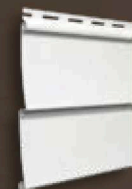
Double 4" Traditional Lap