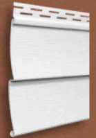
Double 4" Traditional Lap