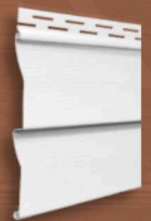
Double 4.5" Dutch Lap